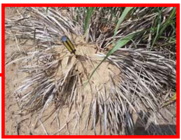
Fire ant nest at Ripley, Ipswich, southeast Queensland, Australia. Photo taken circa 2019.

The tip of the antennae of fire ant ends in a two-segmented club.